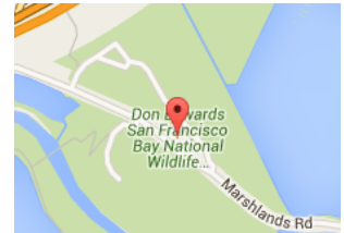
PACK HIKE (Pg. 3) FREMONT, CA SUNDAY, APRIL 17