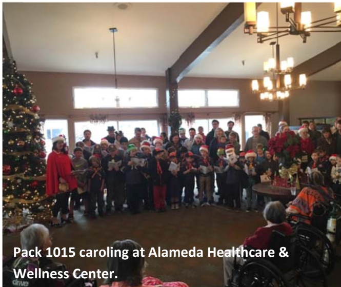
Pack 1015 caroling at Alameda Healthcare & Wellness Center.