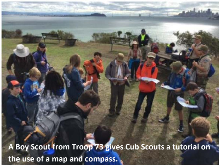
A Boy Scout from Troop 73 gives Cub Scouts a tutorial on the use of a map and compass.