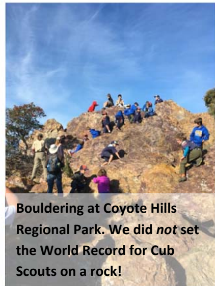
Bouldering at Coyote Hills Regional Park. We did not set the World Record for Cub Scouts on a rock!