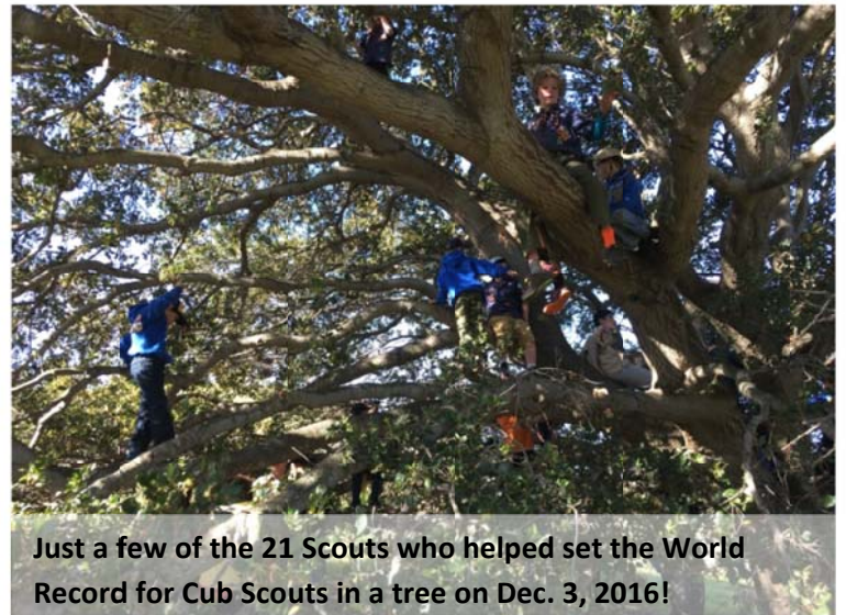
Just a few of the 21 Scouts who helped set the World Record for Cub Scouts in a tree on Dec. 3, 2016!