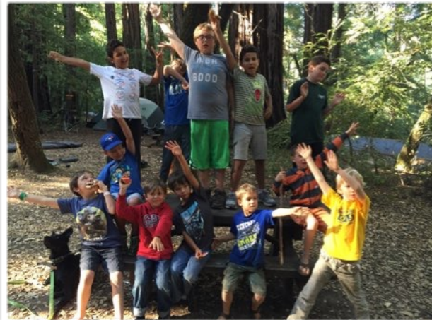
Pack 1015 Summer Family Camping Trip, Portola State Park

Welcome back Pack 1015 families and hello to all potential new Pack 1015 families! We hope you had a great summer and are excited for this upcoming year filled with scouting activities!